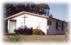
ST JOHN'S CHURCH